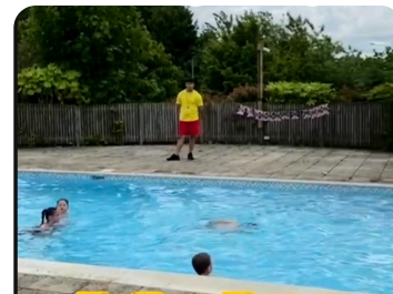
our lifeguard 🚒